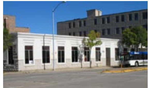
706 Williamson St.