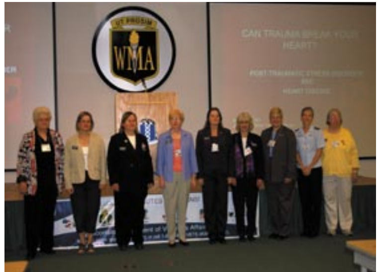
Wisconsin Women Veterans Conference Committee