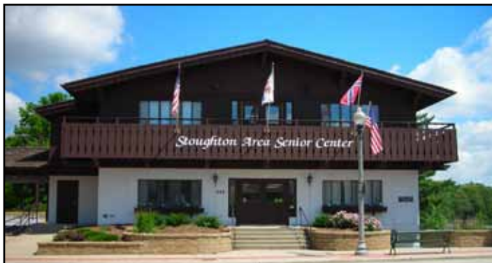
A veteran service officer is available at the Stoughton Senior Center on most Fridays. Call 266-4158 for an appointment at any of the seven outreach sites in Dane County.

The office proudly provides regular outreach to Black Earth, Oregon, Stoughton, Sun Prairie, Madison's VA Medical Center, UW-Madison campus, and Oakhill Correctional Institute. For more information on these outreach locations, please visit http://www.countyofdane.com/veterans/locations.aspx .